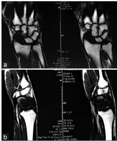
Figure 3: The same lesion is hypointense in fat-suppressed coronal (a) and sagittal T1 view showing the altered signal and destruction of scaphoid (b)

clinical assessment, and judicious use of imaging are critical to timely diagnosis followed by appropriate treatment.