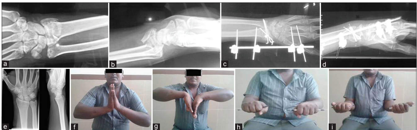
Figure 2: (a) Case series - 1: Preoperative anteroposterior view. (b) Case series - 1: Preoperative lateral view. (c) Case series - 1: Postoperative anteroposterior view. (d) Case series - 1: Postoperative lateral view. (e) Case series - 1: Union 16 weeks. (f) Case series - 1: Dorsiflexion at 2 months. (g) Case series - 1: Palmar flexion at 2 months. (h) Case series - 1: Pronation at 2 months. (i) Case series - 1: Supination at 2 months