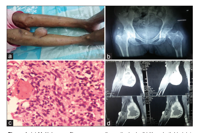
Figure 1: (a) Multiple neurofibromas seen all over the body. (b) X-ray both hip joint showed lytic lesion with fracture in the intertrochanteric region of the left femur. (c) H and E section (×10) from debrided tissue from femur showed spindle-shaped cells arranged in sheets and fascicles along with the necrotic bone. (d) Magnetic resonance imaging of neurofibroma in elbow region showed features of soft tissue sarcoma with no bony involvement.

of sheets and whorls at places. Thick wall blood vessels with perivascular accentuation of tumor cells were also present. Mitotic activity 1/hpf along with necrosis was also seen. All the margins including deep resection margins and overlying skin was involved by the tumor cells [Figure 2b]. S-100 positivity was seen in the tumor cells [Figure 2c]. Fine-needle aspiration cytology (FNAC) from the liver showed malignant spindle cells scattered along with the normal hepatocytes [Figure 2d]. Keeping in view with all these findings, a final diagnosis of MPNST was made with metastasis to femur and liver. The patient was given chemotherapy and other palliative treatment.