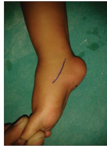
Figure 2: Pre operative planning of incision