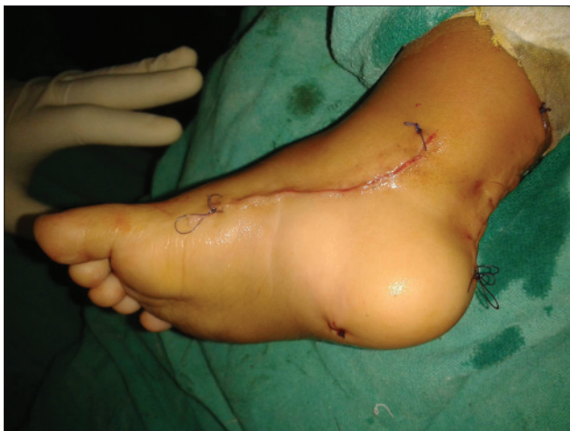
Figure 3: Postop photograph showing both medial and posterior incisions. Good approximation with easy closure