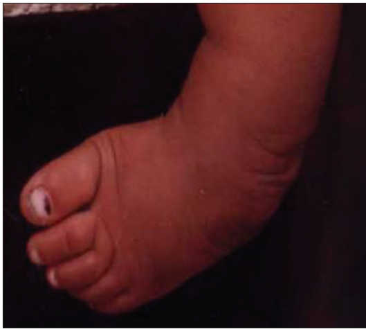
Figure 1: Preop photograph of the Left foot