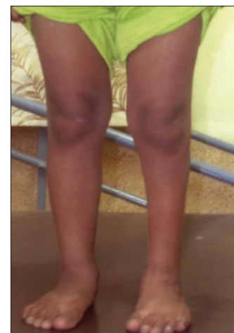
Figure 5: Normal plantigrade foot with excellent functional result

Characteristics of these complications can be associated with the surgical approach used. [8] Wound complications following posteromedial release are inherent to the technique only as the contracted skin posteromedially will never suffice as a cover once the foot is brought to the neutral position. Turco's technique [6] advocates casting in under correction followed by gradual correction in serial casting in weekly casts. This is a difficult situation as the parents expect the child to have normal foot once surgery is over and repeated casting at times under anesthesia