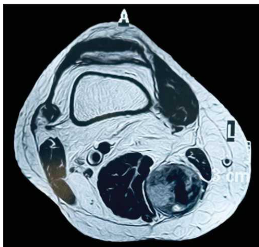
Figure 1: Axial section in CE MRI reveals a heterogeneous mass of size 4 \times 4.2 \times 9.6 cm in muscle without any continuity to bone.

of deformity, trauma, fractures, or a history of radiation. The swelling was soft and fluctuant. The slip sign was negative and appeared to be adherent to underlying tissue. The overlying skin is free. Contrast enhanced magnetic resonance imaging (CE-MRI) was done which indicated 4 \times 4.2 \times 9.6 cm (Anteroposterior \times Transverse \times Craniocaudal) involving the inter/intramuscular plane of the medial compartment of the distal 1/3rd part of the right thigh with involvement of the gracilis muscle and tendon and causing muscle expansion resulting in mass effect on the semimembranosus muscle and superficial femoral vessel pushing this structure medially, with normal intervening fatty planes [Figure 1]. The biopsy suggested osteosarcoma [Figure 2]. The patient was administered three cycles of adriamycin and cisplatin. CE MRI indicated a 9.5 \times 4.5 \times 3.5 cm mass arising from the gracilis muscle and resulted in significant expansion with extension into adjacent intermuscular planes, consistent with soft tissue sarcoma [Figure 3]. Then, a tumour resection of the