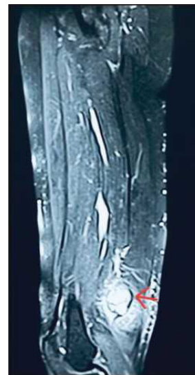
Figure 3: CE MRI of right thigh showing a soft tissue mass of 9.5 \times 4.5 \times 3.5 cm (red arrow).

right thigh was performed. The size of the resected specimen is 13 \times 5.5 \times 4 cm and the tumour is grey-white to grey-brown and measures 6.5 \times 3.6 \times 3.5 cm. Tumour cells are large oval to spindle-shaped with coarse to vesicular nuclear chromatin. Pleomorphic-type tumour cells can be seen. A large area of necrosis was visible. Adjacent muscle and both resection limits are free of tumour. Then, the patient received two more cycles of chemotherapy. The patient is currently under treatment and is showing significant improvement in symptoms.