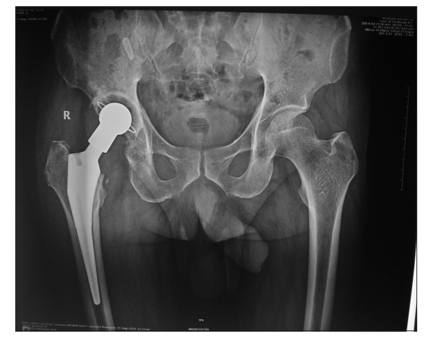
Figure 3: X-ray of the pelvis with bilateral hips in anteroposterior view showing reverse hybrid total hip replacement of the right side

tissue extensively replace bone tissue, therefore, Hagendoorn<sup>[6]</sup> suggested that the signaling pathway of the platelet-derived