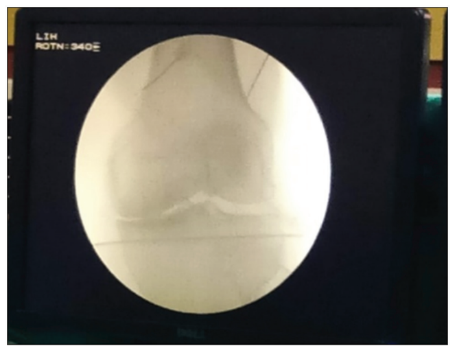
Figure 1: Fluoroscopic image in AP view showing RF cannula placement at the junction of shaft of femur with the femoral condyles where the superomedial and superolateral genicular nerves traverse

sample was enrolled. Allotment of numbers and patient enrollment were done by an OT nurse not involved in the procedure.