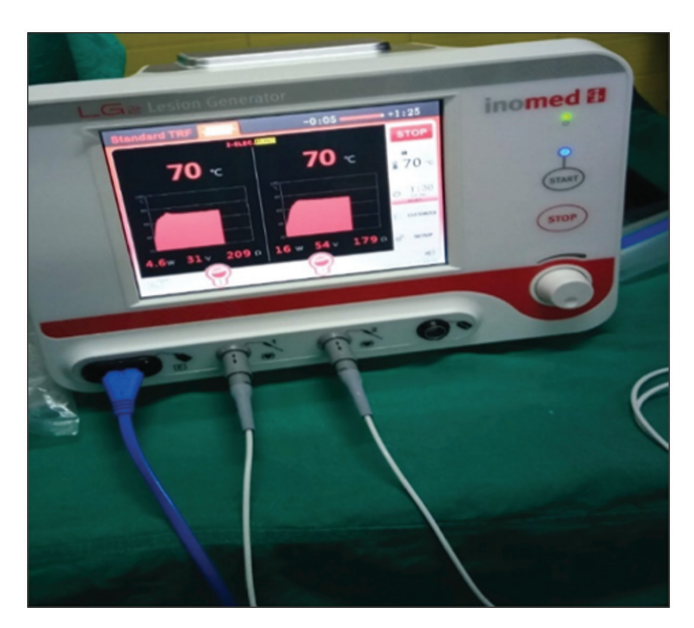
Figure 3: Image shows RFA of two Genicular nerves being performed simultaneously using unipolar two electrodes

sterile technique was used throughout the procedure. A 21G needle was inserted horizontally and advanced to the intercondylar notch and injected with 2 mL of 80 mg of methylprednisolone acetate and local anesthetic.