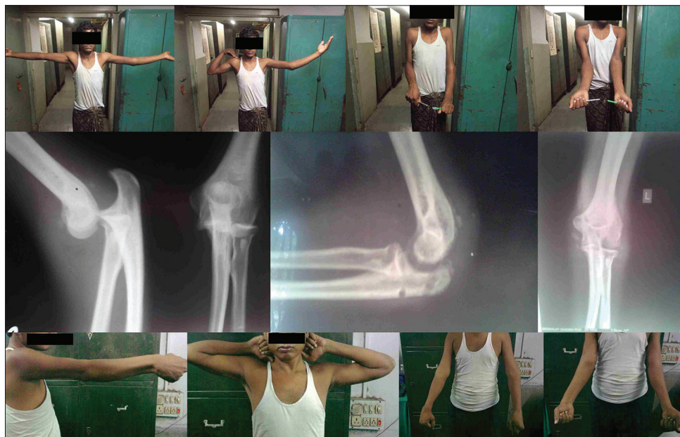
Figure 3: Clinical case of group II