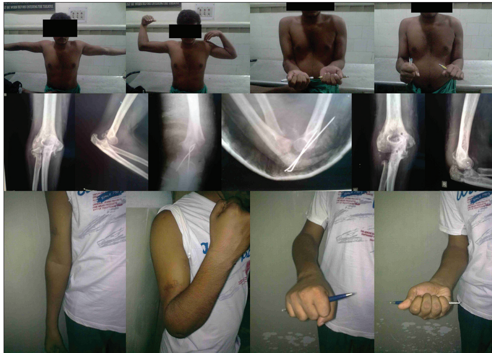
Figure 2: Clinical case of group I