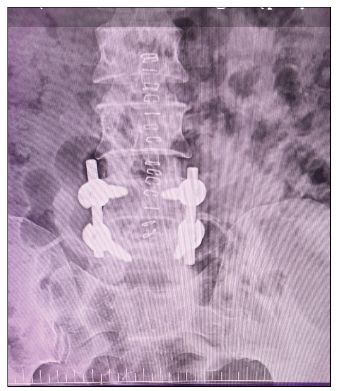
Figure 6: Follow-up X-ray showing discs with pedicular screws in situ

6 weeks and posterior stabilization. We believe that such associated cases have not been reported from our country previously and this is the first of its kind.