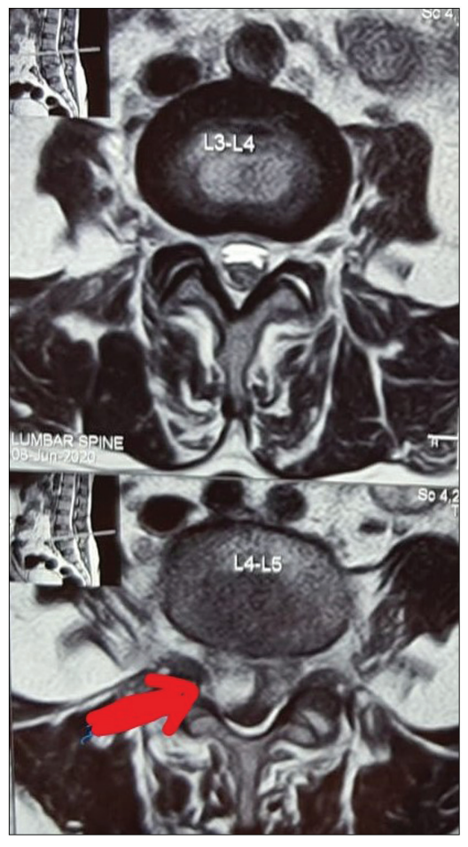
Figure 3: MRI (transverse section) showing spondylolysis with spondylolisthesis with an epidural abscess at L4-L5 with a defect in Pars interarticularis at L4-level with epidural abscess and reduced disc space at the same level, no paraspinal soft tissue involvement or gibbus formation