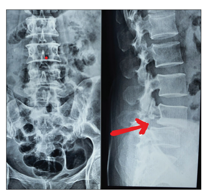
Figure 1: X-ray LS spine showing Grade II spondylolisthesis at L4-L5