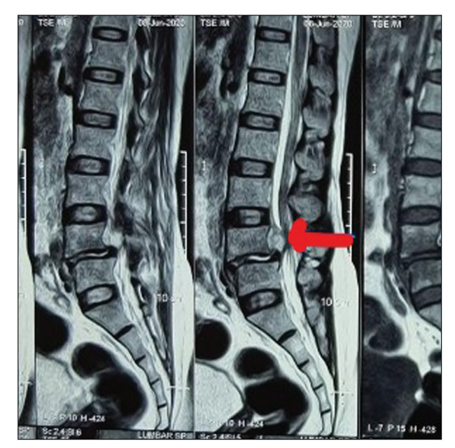
Figure 2: MRI (longitudinal section) showing spondylolysis with spondylolisthesis with an epidural abscess at L4-L5 with a defect in Pars interarticularis at L4-level with epidural abscess and reduced disc space at the same level, no paraspinal soft tissue involvement or gibbus formation