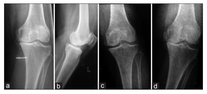
Figure 1: Preoperative radiographs of the patient. (a) Antero-posterior view of left knee showing complete loss of joint space in the medial compartment; however, the lateral compartment is intact. (b) Lateral view showing femoral condyles centered over the tibial plateau suggestive of intact ACL.<sup>[5]</sup> (c) Valgus stress view showing opening of the medial joint space, correction of the varus deformity on stress and a maintained lateral compartment. (d) Varus stress view showing bone on bone obliteration of medial joint space

In the current case, the inefficient control over the use of the saw blade and design of the tibial cutting jig with inadequate protection on the lateral side were the main reasons for the avulsion of ACL [Figure 3]. In the case of Oxford Unicondylar knee replacement, the balancing is made by bone cuts rather than soft tissue, so the bone cuts should be made precise. [2] UKR is considered "surgically more demanding" than the TKR. [10,11] Although the failures are common in low volume surgeons, intraoperative handling of instruments and skill of the surgeons also affect the surgery. [10] The saw blade should be firmly held to prevent deflection [Figure 3a]. A medial collateral ligament (MCL) protector can be used in the medial side to protect the medial structures [Figure 3b]. However, the Oxford medial UKR tibial cutting jig (sim)