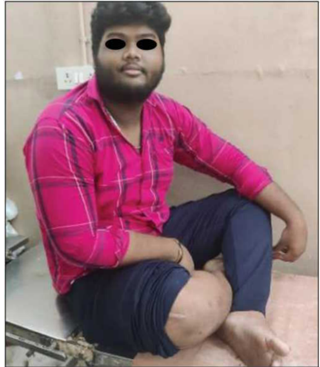
Figure 1: Clinical picture of patient at one-year post-op sitting with crossed legs.

Statistically no difference in mean scores between the two groups