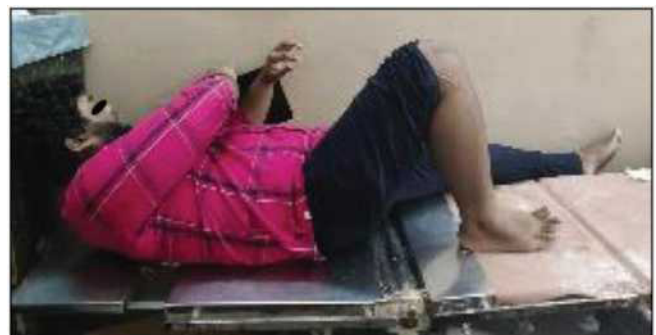
Figure 3: Complete flexion of knee at one-year post-op.