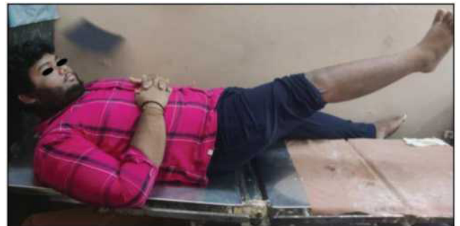
Figure 2: Active straight leg raising test at one-year post-op.