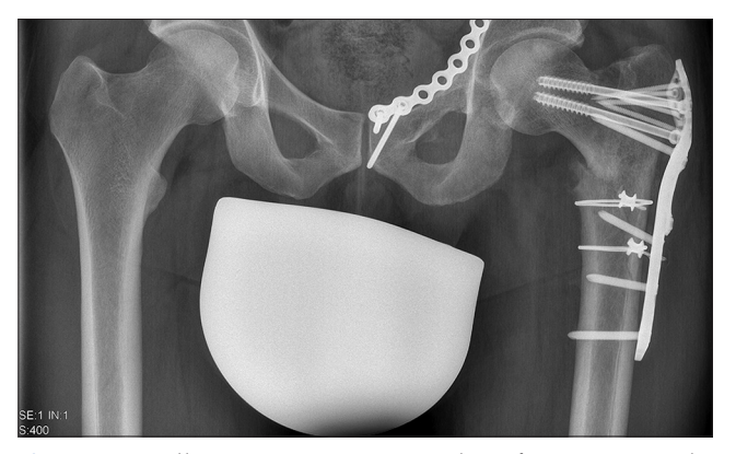
Figure 3: Follow-up X-ray 4 months after trauma, the caput-collum-diaphysis angle decreased to 112°

for recovery of the CCD angle [Figure 4]. After 2 weeks of unweighted mobilization, the femoral head and neck fragment was still in place. Sixteen months after trauma, the patient was able to walk freely without any help. A control CT scan showed no signs of femoral head necrosis but fast progress of arthritis and limited bony healing.