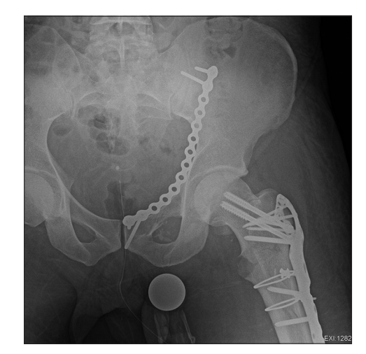
Figure 2: Control computed tomography showing anatomical reduction caput-collum-diaphysis angle 139° on the right side (not shown), 137° on the reconstructed left side

The main considerations for our therapeutic strategies were the patient's young age, location of the fragments, and fracture morphology.<sup>[2]</sup> Thus, we chose ORIF with retrieval of the dislocated fragment via direct scrotal incision. The dislocation of the femoral head puts it at high risk for necrosis when the blood supply cannot be restored in time.<sup>[3]</sup> The combination of tension wires and TSP provided sufficient fixation for both the proximal femur fragment and the greater trochanter fragment.