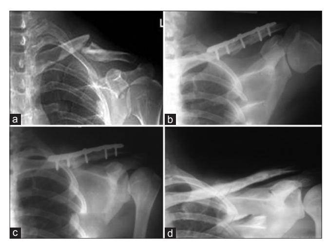
Figure 1: Skiagrams of a left clavicle of a 20–year-old male patient showing (a) midshaft clavicle fracture, (b) immediate postoperative X-ray with plate in situ , (c) 3 months postoperative with fracture union, and (d) after implant removal

Mean injury time was 3.61 \pm 3.28 days in Group I as compared to 3.64 \pm 2.76 days in Group II. Statistically, this difference between two groups was not significant (P = 0.968). However, mean duration of hospital stay, as well as mean amount of blood loss, was higher in Group I (2.36 \pm 1.03 days and 115.25 \pm 30.54 ml) as compared to that in Group II (1.64 \pm 0.78 days and 55.30 \pm 16.77 ml), and this difference was statistically significant (P < 0.05). The mean length of incision was longer in Group I ( 10.35 \pm 1.06 cm) as compared to that in Group II (4.38 \pm 0.75 cm). For both these parameters, the difference between two groups was significant (P < 0.001). Mean pain score was higher in Group I (3.33 \pm 1.47) as compared to that, in Group II (2.91 ± 1.42), yet this difference was not statistically significant (P = 0.238). Time taken for union ranged from 3 to 11 months with a mean value of 5.91 \pm 1.89 months. Union time was slightly longer in Group I (6.00 \pm 2.41 months) as compared to