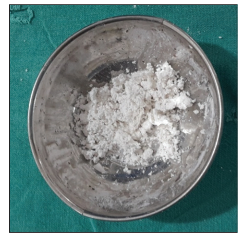
Figure 1: Mixture of calcium sulfate and vancomycin mixed with NS (sodium chloride 0.9%) to the shown consistency

Chronic orthopedic infections of the bone and surrounding soft tissue represents inflammatory and progressive bacterial infections are difficult to manage. It was first described in 1852 by the French Surgeon Edouard Chassaignac in a case of a 2-year-old child.<sup>[4]</sup> However, already in the 17<sup>th</sup> century BC, osteomyelitis was specified in the Egyptian Edwin Smith