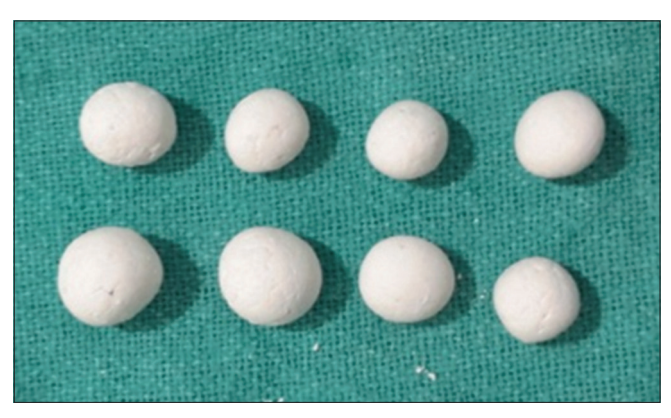
Figure 2: Biodegradable antimicrobial pellets were made in desired shape and size (hand-molded) according to the required area for implantation