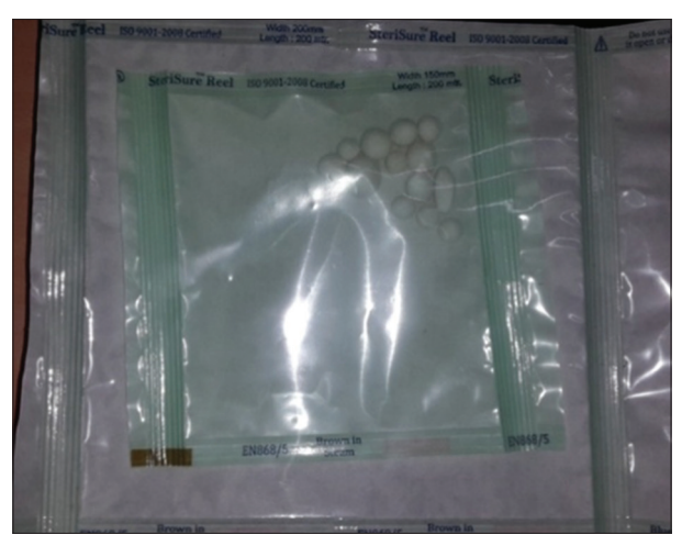
Figure 3: ETO-sterilized biodegradable antimicrobial beads

Furthermore, inadequate treatment of the acute phase allows osteomyelitis either to persist and become chronic or relatively "dormant" for a considerable time, only to recur at a later phase.