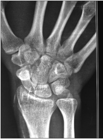
Figure 1: Right wrist Joint A-P view