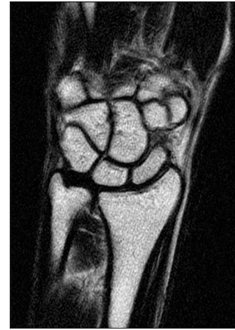
Figure 3: MRI Cor T2 FSE of right wrist joint

Radiographic examination is essential for diagnosis and classification of all carpal fractures and dislocations. All wrist