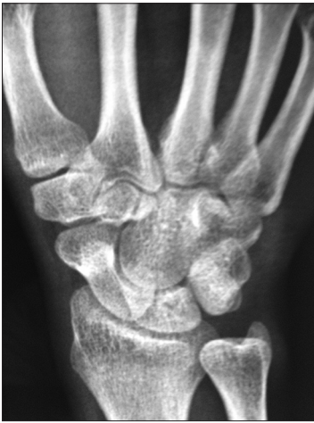
Figure 2: Right wrist joint oblique view

incidence of isolated trapezoid fractures is due to its relatively protected position within the carpus, with both osseous and strong ligamentous stabilizers.